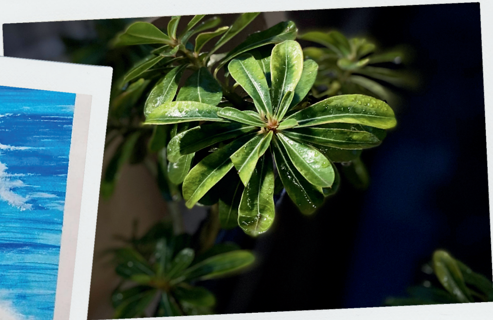
Clicked by lokesh