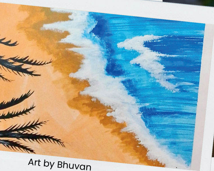
Art by Bhuvan